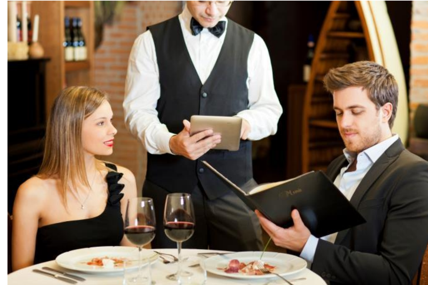
Fine Dining Restaurant