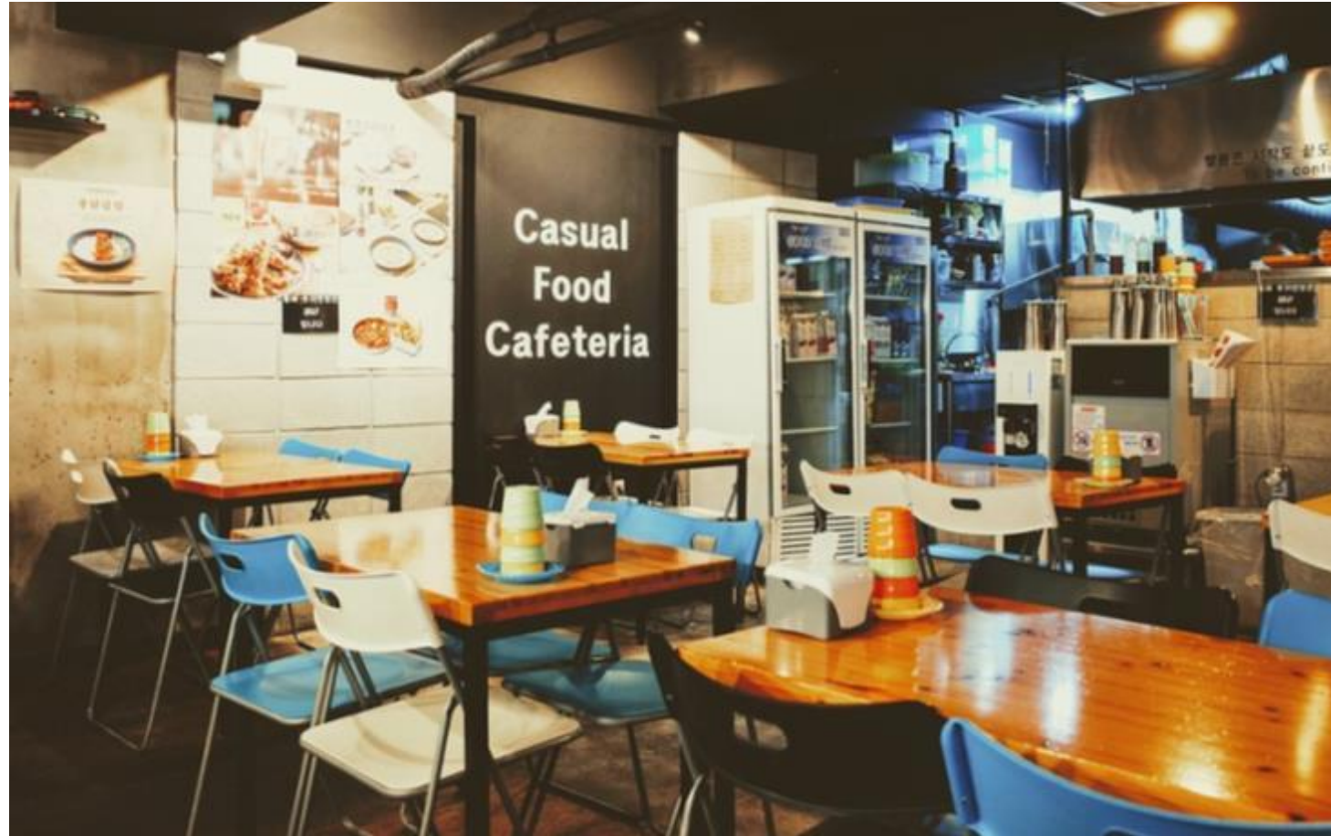
Casual Dining Restaurant