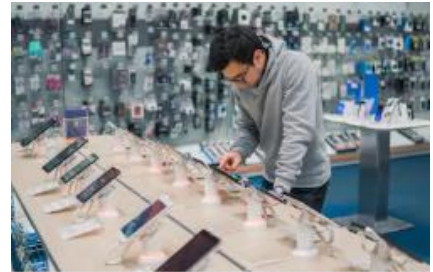
Consumer Electronic Shop